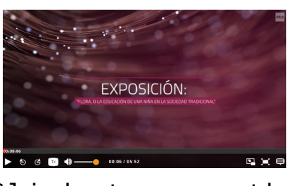
Click to see the video

Central Library of UNED, from 28 September to 21 October 2022